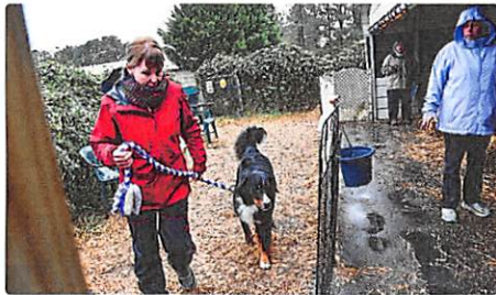
Barn Hunt Agility